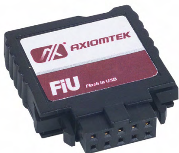
10pin USB Flash Module