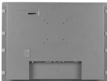
Various Mounting ways Panel/ Wall/ VESA