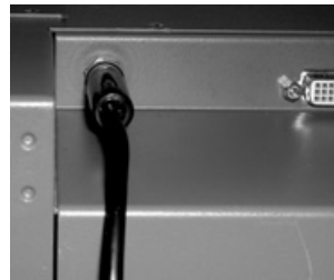
Screw-type Power Input