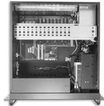
Top view with 14-slot backplane