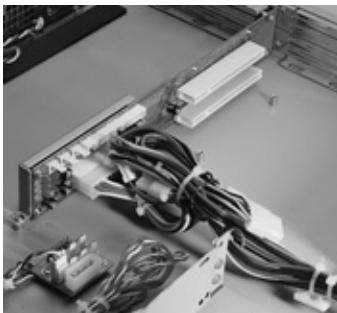
Built-in a butterfly backplane with 2 free PCI slots for expansion