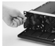
Removable fan filter on the front panel